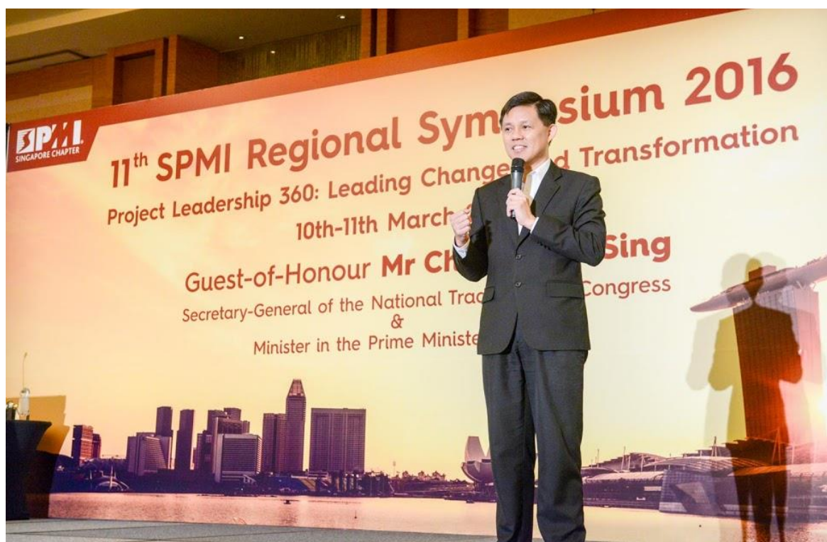
GOH, Mr. Chan Chun Sing, Secretary General, NTUC and Minister in the Prime Minister's Office on stage giving his GOH Speech.