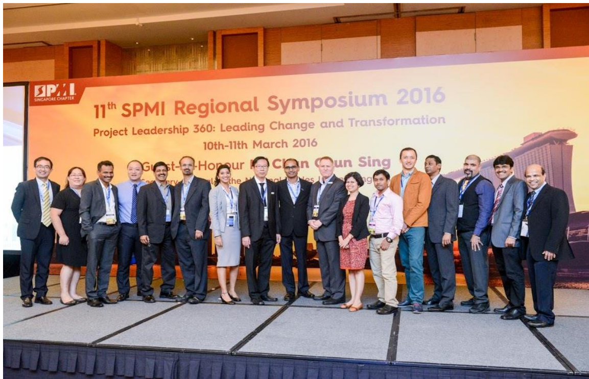
SPMI 2015-2016 Board Members and Support Team Members