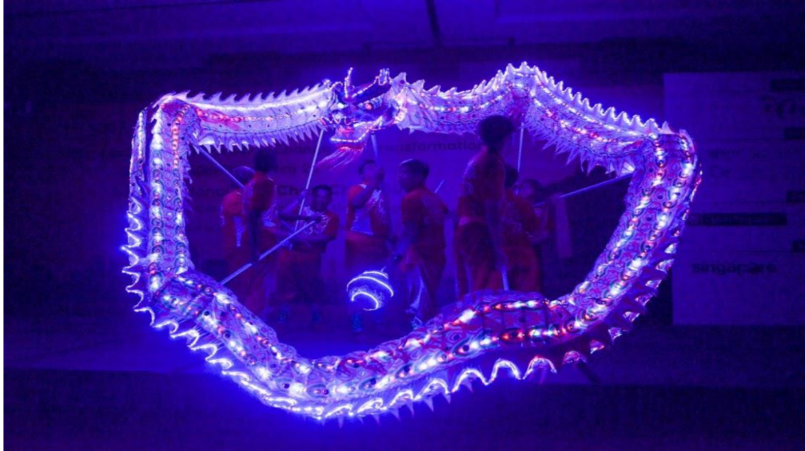
Opening ceremony of Symposium 2016.