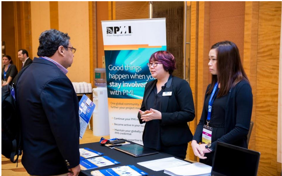
Symposium Attendees at the PMI/SPMI Exhibition Booth.