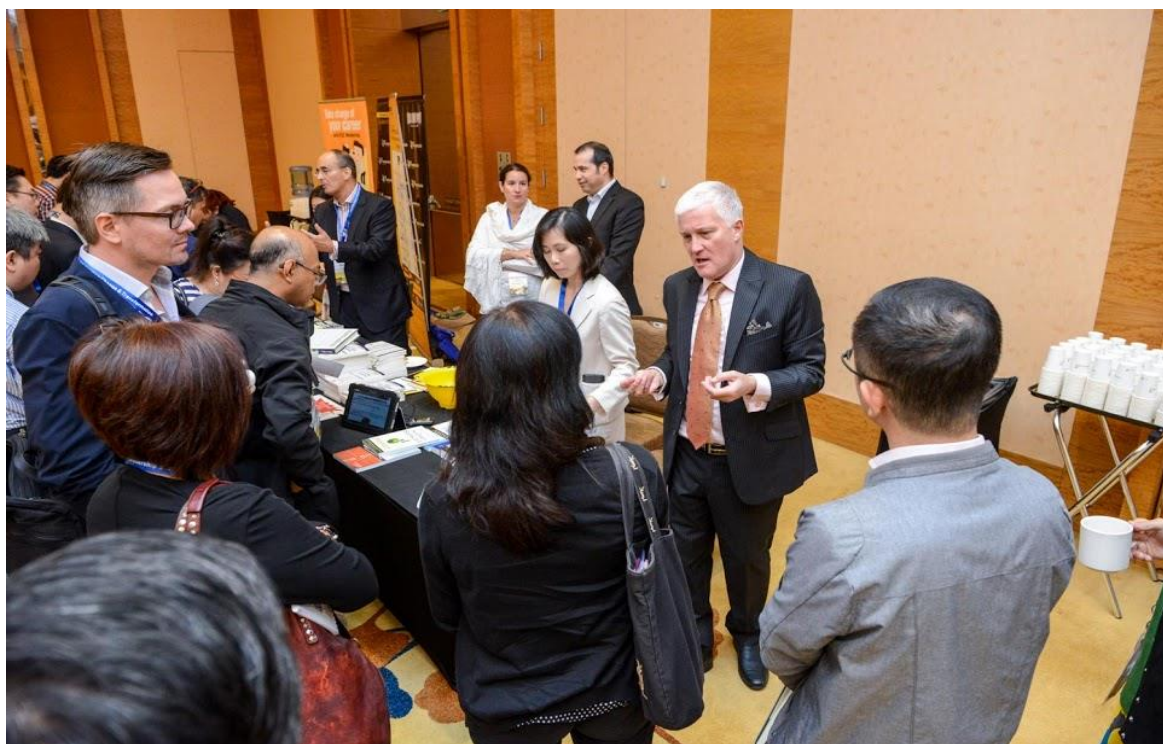
Symposium Attendees at the Business Evaluation Centre Exhibition Booth.