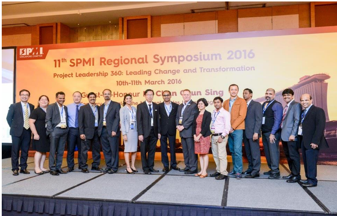
SPMI 2015-2016 Board Members and Support Team Members