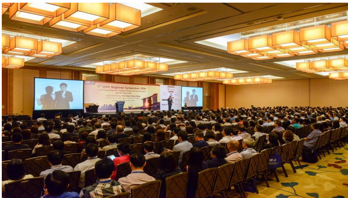
GOH, Mr. Chan Chun Sing, Secretary General, NTUC and Minister in the Prime Minister's Office on stage giving his GOH Speech in the Main Hall.