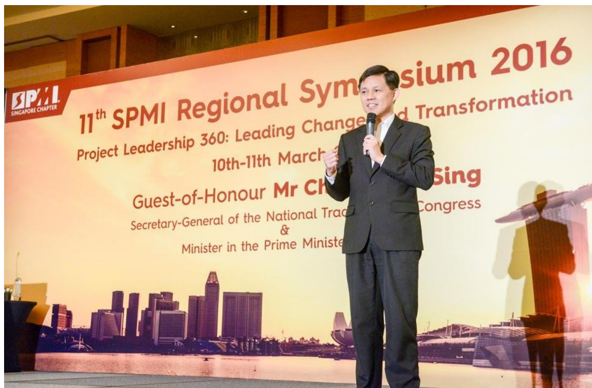
GOH, Mr. Chan Chun Sing, Secretary General, NTUC and Minister in the Prime Minister's Office on stage giving his GOH Speech.