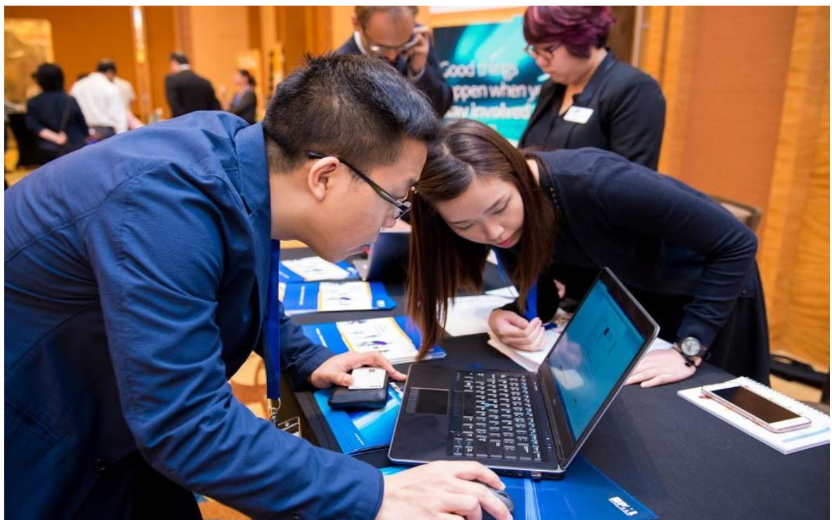
Symposium Attendees at the PMI/SPMI Exhibition Booth.