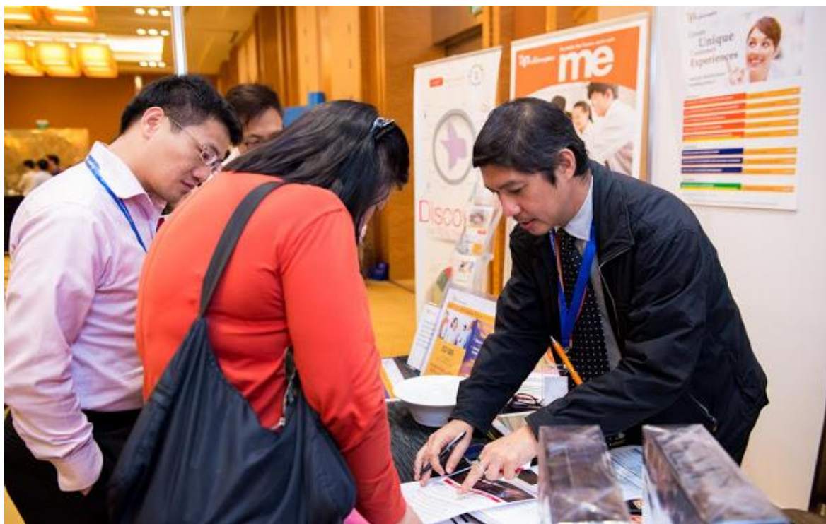
Symposium Attendees at the NTUC Learning Hub Exhibition Booth.