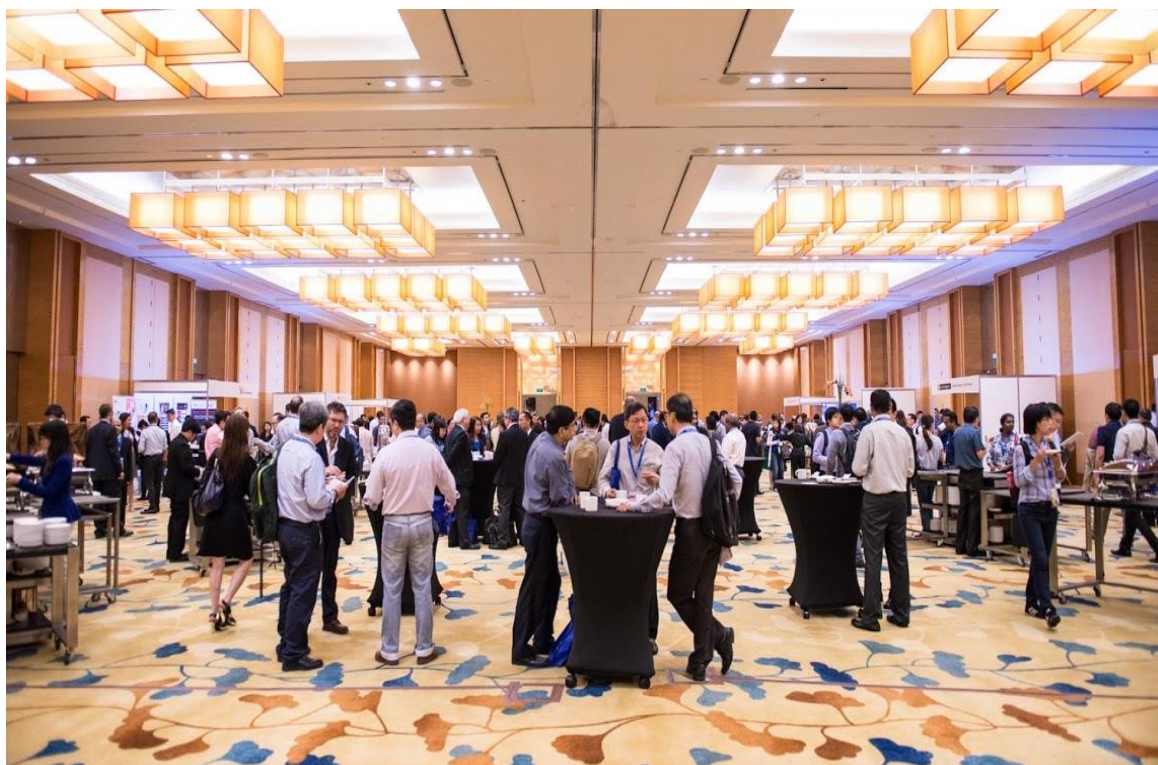
Symposium Attendees in the Exhibition Hall.