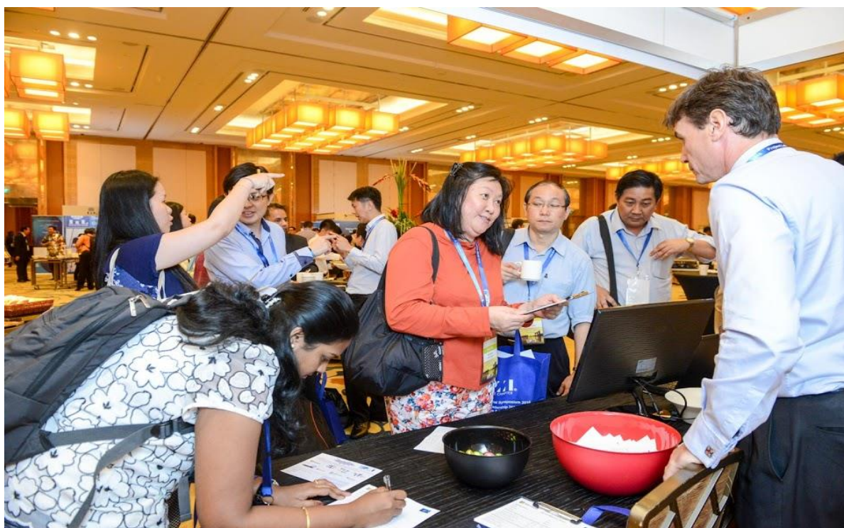
Symposium Attendees at the Microsoft Exhibition Booth.